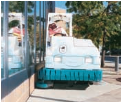
Down pressure stays constant even as the brushes wear or the surfaces change – whether indoors or out.