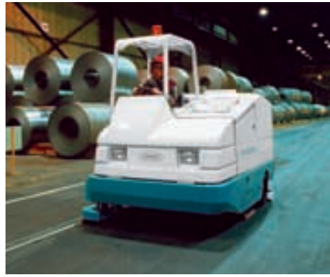
Built solid for heavy-duty cleaning inside factories.