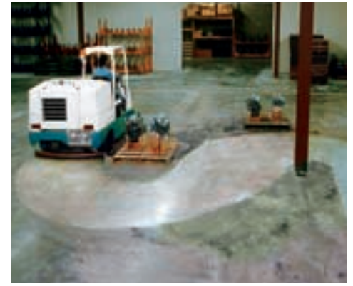
Front wheel propulsion makes for dynamic maneuverability around obstacles.