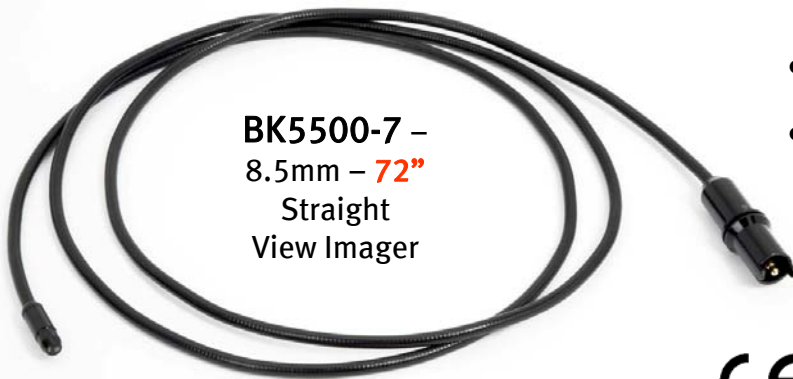
BK5500-7 – 8.5mm – 72” Straight View Imager