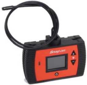
BK5500 not included