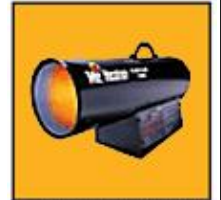
FORCED AIR PROPANE