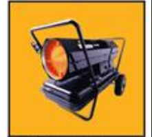
FORCED AIR KEROSENE