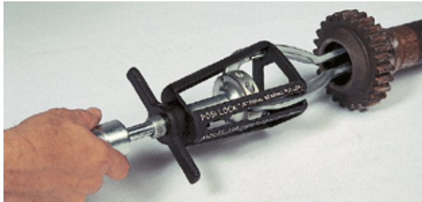
Needle bearing removal from transmission gear

(3 Jaw 4" 5 Ton Puller) (Tip Protector) (3 Jaw Internal Puller) (Slide Rod) (2.5 lb. Hammer) (Set of 3 Long Jaws)